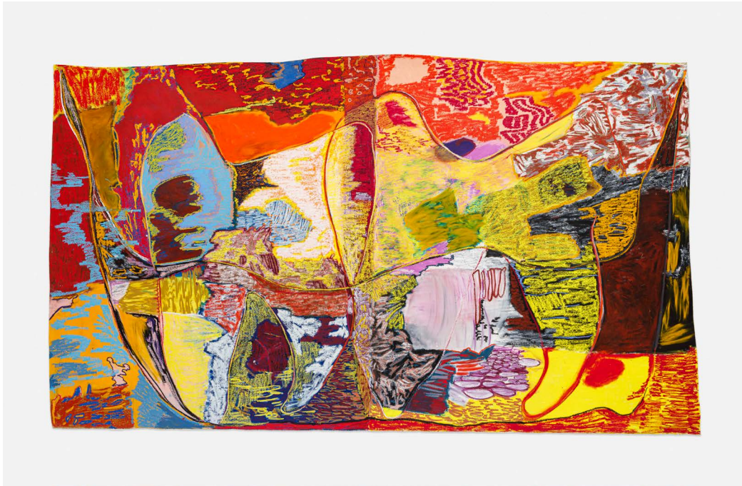
Rachel Jones, a shorn root , 2022. Oil stick, oil pastel on canvas (unstretched). 185 x 316 cm (72.83 x 124.40 in). © Rachel Jones.

18 March—28 May 2023 Long Museum, Shanghai, China