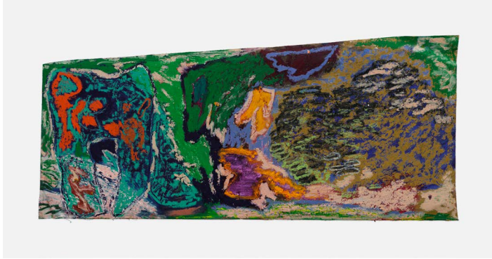
Rachel Jones, a shorn root , 2022. Oil stick, oil pastel on canvas (mounted). 26 x 60 cm (10.23 x 23.62 in). © Rachel Jones.

functions as a site of contact between distinct realms – the interior and the exterior, the psychological and the bodily, the figurative and the metaphorical. Activated by the cacophonies of colour laid down beneath, the outlined shape of the tooth is repeated across the paintings as a symbolic shorthand for interior experience, particularly the interiority of Black lived experience, in a mode that is untethered from direct bodily representation.