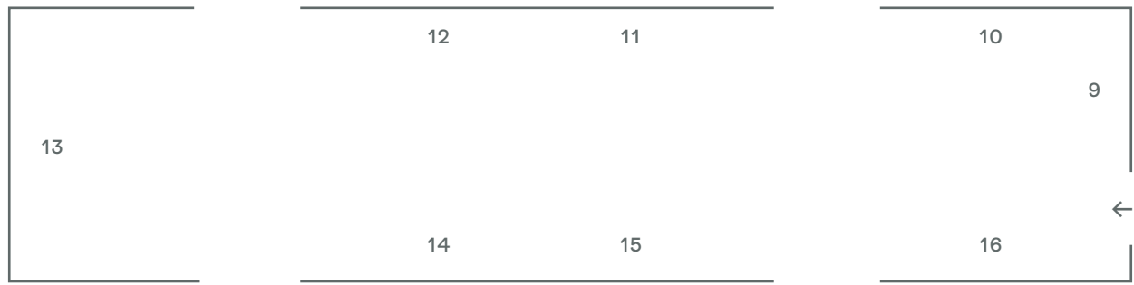
SALA PICCOLO TEATRO