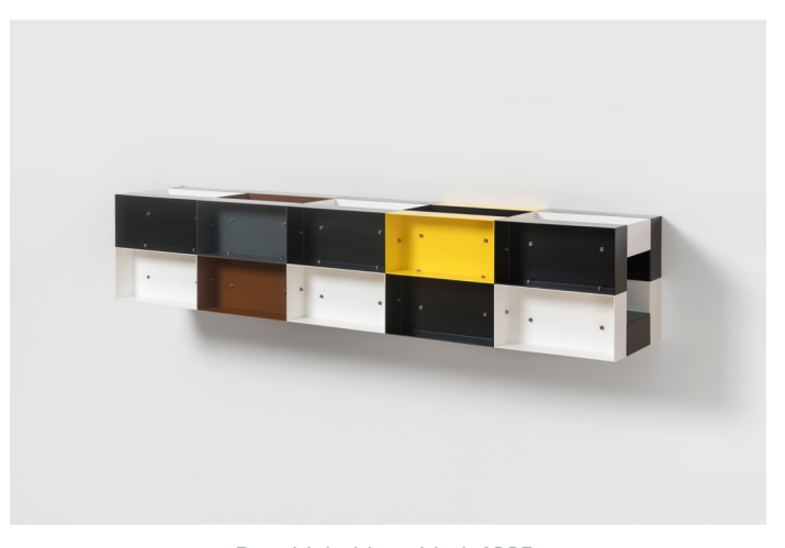
Donald Judd, untitled, 1985. Painted aluminum. 30 \times 150 \times 30 cm (11 3/4 \times 59 1/4 x 11 3/4 in).

'Actual space is intrinsically more powerful and specific than paint on a flat surface.' Works that occupy such space, Judd continued in his 1964 essay 'Specific Objects', 'are not diluted by an inherited format.' For Judd, the transition to working in three dimensions liberated him from the pictorial conventions that working on canvas tied him to. It also allowed him to explore empty space, which takes a different form in each of the wall works and floor works on view. In the catalogue accompanying the exhibition, Michael Govan, director of the Los Angeles County Museum of Art, relates this exploration to the intentional, even provocative, use of emptiness in Korean art and architecture: a tradition that likely influenced Judd's own theory of space. The three-dimensional works on view at Thaddaeus Ropac Seoul embody these principles across several of the materials for which Judd is best known: aluminium, plexiglass and plywood.