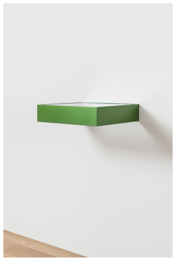
Donald Judd, untitled, 1989. Green anodized aluminum and clear plexiglass. 15.2 x 68.6 x 61 cm (6 x 27 x 24 in).

Thaddaeus Ropac Seoul Fort Hill 2F, 122-1, Dokseodang-ro, Yongsan-gu, Seoul