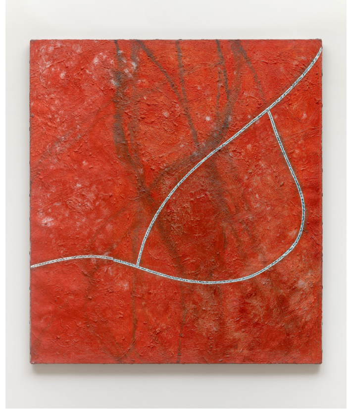
Donald Judd, untitled, 1960. Oil on canvas. 102.2 x 91 cm (40 1/4 x 36 in).

After commencing as a traditional painter, Judd turned away from representation, realising that the most 'real' art he could make is not that which depicts what is not present, but that which emphasises what is. In the paintings on view, line and field both extend across the height and breadth of the canvas to embrace it: a way, for Judd, of acknowledging the form and spatial presence of the support as an essential element of the work. Believing that illusionism in painting undermined the objecthood of the artwork, Judd sought in his paintings to create a balance between the pictorial plane and the support, whereby the two form a coherent whole. Created shortly before Judd abandoned the canvas to work directly in 'real space' in 1962, these paintings represent the culmination of the artist's two-dimensional practice.