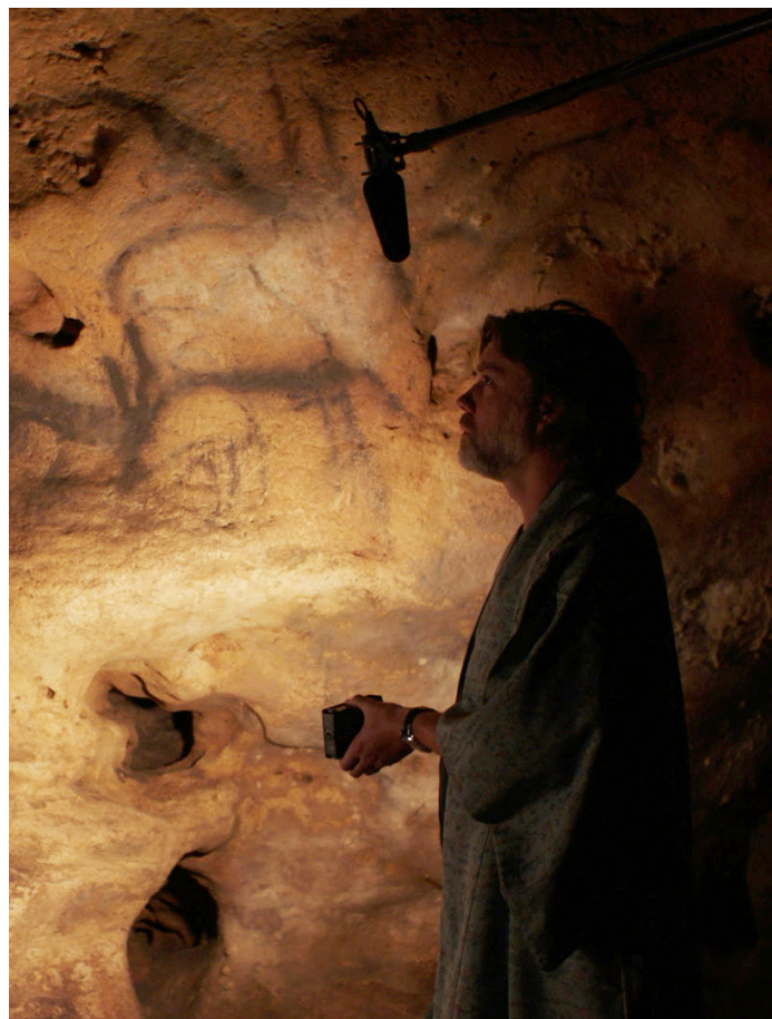
Rufus Wainwright during the shoot of Resonance Project: The Cave, 2024.