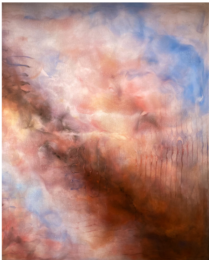
Oliver Beer, Resonance Painting (The Time Has Come Today) , 2026(detail). Pigment on canvas. 200 x 250 cm (78.74 x 98.42 in)

cave but responding to it acoustically, and the frequencies that determined where they placed their marks are the same frequencies Beer was working with. This research led to his critically acclaimed installation Resonance Project: The Cave , presented at the 17th Biennale de Lyon (2024–25) and now touring internationally.