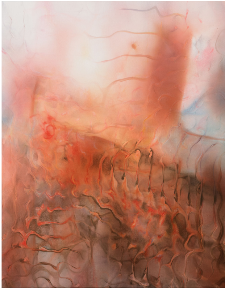
Oliver Beer, Resonance Painting (Kings and Stars) , 2026 Pigment on canvas. 150 x 120 cm (59.06 x 47.24 in)

Thaddaeus Ropac Ely House, London 37 Dover Street, London, W1S 4NJ