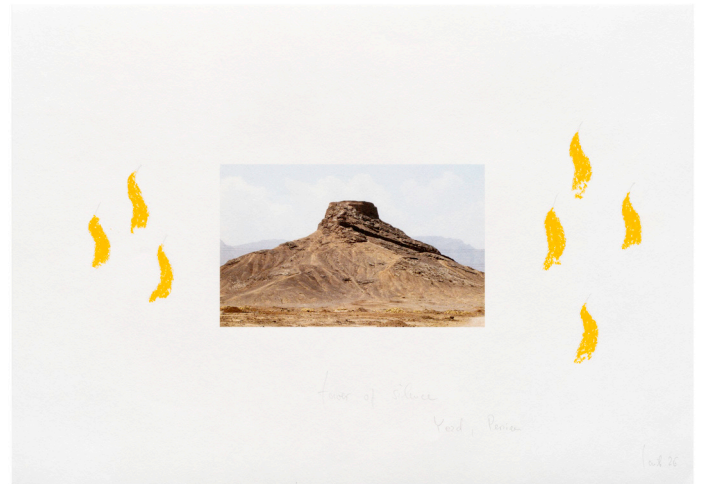
Wolfgang Laib, Tower of Silence, Yezd, Persien , 2026 Print, pencil and oil pastel on paper. 29.6 x 42 cm (11.65 x 16.54 in)

The artist's works are currently on view in a celebrated solo exhibition at the Kunsthaus Zürich (until autumn 2026).