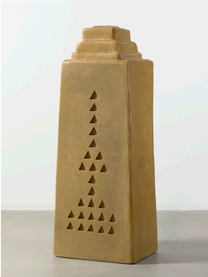
Wolfgang Laib, Turm des Schweigens , 2026 Beeswax. 197 x 63 x 79 cm (77.56 x 24.8 x 31.2 in)

The motif of the tower has occupied a central place in the artist's work for years, and last summer he created five wax towers for the exhibition, one for each room. These works form part of an ongoing series of striking architectural forms that Laib sculpts from wax on the hottest days of the year, when the material can be worked outdoors using the natural heat. The works are created in dialogue with nature and in harmony with the seasons. In addition to narrow towers, the series also includes small houses and ziggurat structures with stepped forms. Through a process of reduction, Eastern and Western traditions merge to form these representative shapes.