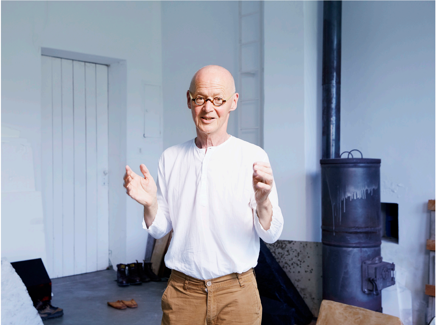
Portrait of Wolfgang Laib, 2017