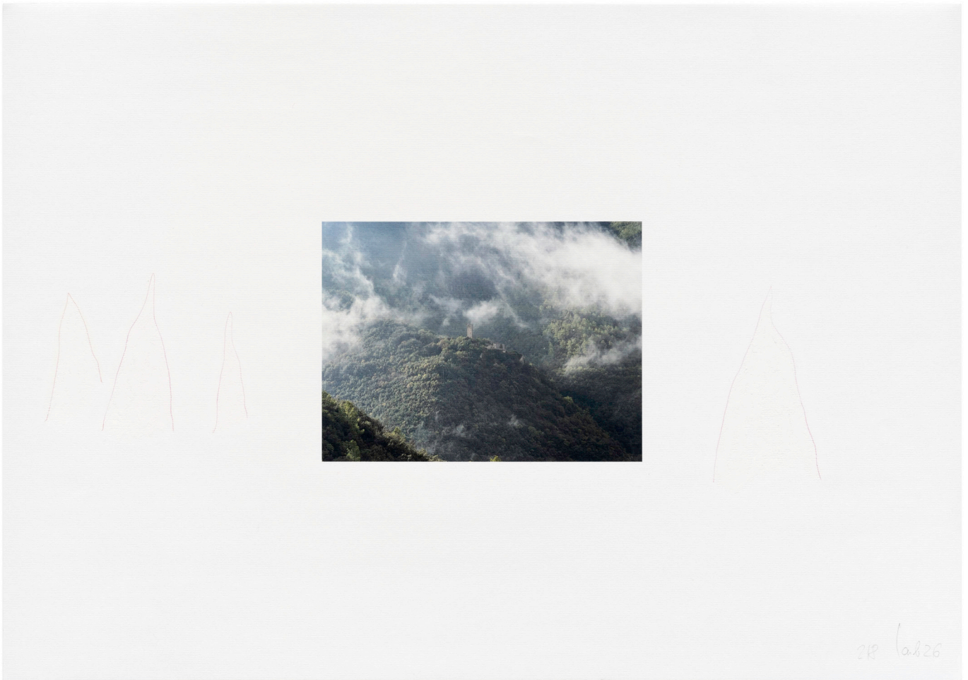
Wolfgang Laib, Mittelalterlicher Turm bei Spoleto, Italien , 2026 Pencil and oil pastel on paper. 29.6 × 42 cm (11.65 × 16.54 in)

Thaddaeus Ropac Salzburg Villa Kast Mirabellplatz 2, 5020 Salzburg