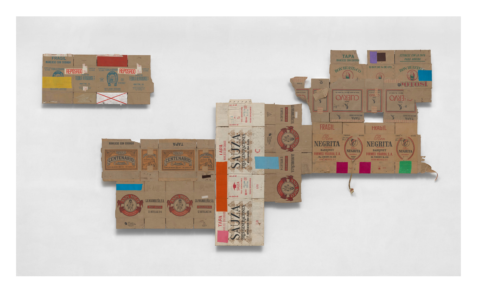
Robert Rauschenberg, Night Post / ROCI MEXICO, 1985. Acrylic, fabric and tape on cardboard. approx. 214 x 397 x 10 cm (84.25 x 156.3 x 3.94 in).

began working on copper as a sign of solidarity with the Chilean people. The Copperhead-Bites / ROCI CHILE (1985) fuse artistic innovation with the artist's desire to reflect the socio-political conditions of the people he encountered, many of whom worked in copper mines during the oppressive regime of dictator Augusto Pinochet. At the same time, the artist was cultivating his own artistic evolution, resulting in the production of 15 metal painting series over the following decade.