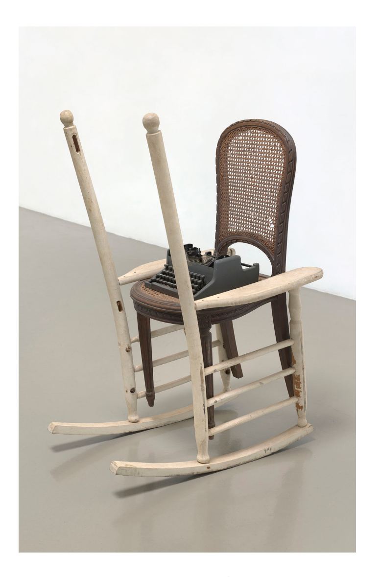
Robert Rauschenberg, Magnetic Script / ROCI TIBET, 1985. Construction with chairs and typewriter. 110.5 x 77.8 x 58.6 cm (43.5 x 30.63 x 23.07 in). © Robert Rauschenberg Foundation

contextualised with archival materials. A selection of the artist's black-and-white photographs, taken as source material during his travels and used for the silkscreen images in the ROCI works, are also included. Together, these elements offer an unprecedented overview of one of the most ambitious and wide-reaching artistic interchanges of the late-20th century.