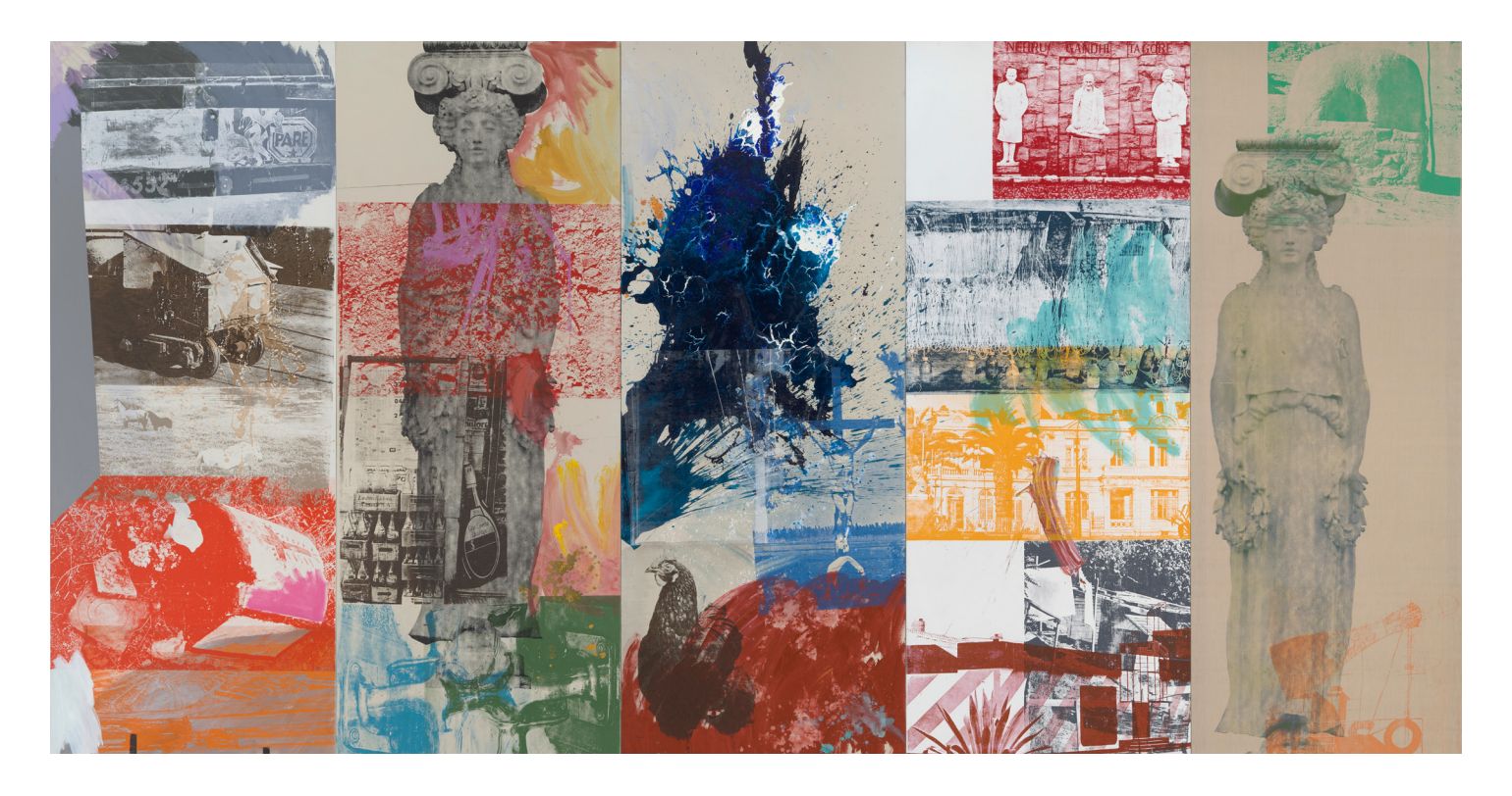
Robert Rauschenberg, Caryatid Cavalcade I / ROCI CHILE, 1985. Silkscreen ink, acrylic and graphite on canvas. 352.2 x 655.6 cm (138.66 x 258.11 in).

Thaddaeus Ropac Ely House, London 37 Dover Street, London, W1S 4NJ