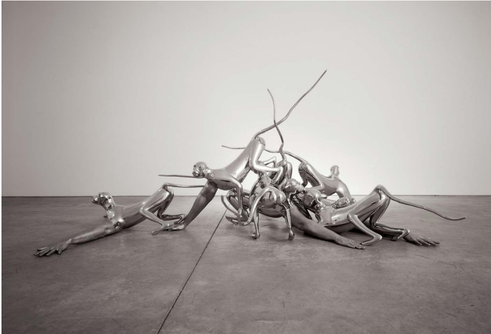
Rona Pondick, Monkeys , 1998–2001. Stainless steel. Edition of 6 + 1 AP. 104.77 x 167.64 x 217.17 cm (41.25 x 66 x 85.5 in). © Rona Pondick.

Thaddaeus Ropac London Ely House 37 Dover Street, London, W1S 4NJ