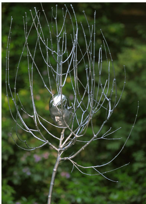
Rona Pondick, Head in Tree (detail), 2006–08. Stainless steel. 266.7 x 106.88 x 93.98 cm (105 x 42.08 x 37 in). Installation view of Sonsbeek, 2008.

In the four decades of her artistic career, Pondick has worked across a wide variety of traditional and nontraditional materials, and her use of stainless steel has been particularly pivotal in steering the direction of her sculptural practice. First employed in the late 1990s when she created her earliest animal-human hybrids, the reflective material is intimately connected to her deep interest in states of metamorphosis, allowing her to experiment with surface texture – ‘it looks as if it’s disintegrating in front of you, as if it were in flux.’ Viewers’ bodies are captured, distorted and mirrored as reflections upon the shiny surfaces of the steel sculptures, integrating their image into the tangle of human, plant and animal forms.