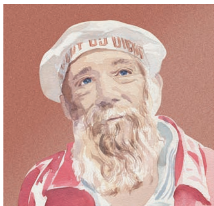
THOMAS DEMAND ▾