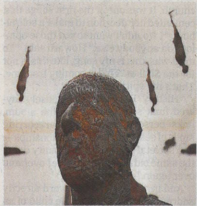
Detail of “Lost Horizon I,” a Gormley work from 2008.