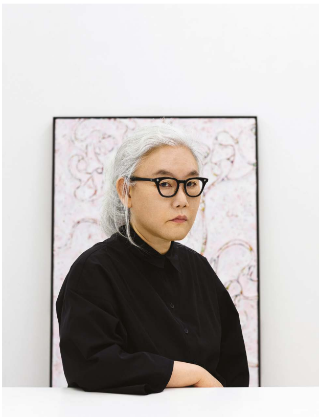
© Lee Bul. Photo by Hye-Ryoung Min. Courtesy of the artist.

Lee Bul lives and works in Seoul, South Korea. Her 1997 installation Majestic Splendor at The Museum of Modern Art, New York used rotting fish encrusted in sequins as a commentary on the ephemeral nature of beauty and the powerlessness of women, causing a furore and establishing her international reputation as an emerging artist. In 1999, she was selected by curator Harald Szeemann to participate in the International Pavilion at the 48th Venice Biennale, where her work was also shown in the Korean Pavilion. Lee Bul has had solo exhibitions at the New Museum,