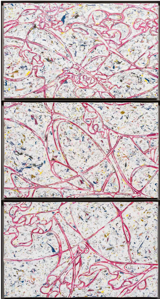
Lee Bul, Perdu CXVII , 2021. Mother of pearl, acrylic paint on wooden base panel, stainless steel frame. Triptych: 189.5 x 83.3 x 6.6 cm (74.61 x 32.8 x 2.6 in). © Lee Bul.

and its imaginative potential to reveal its darker undertones. Born in 1964 to left-wing dissident parents under South Korea's military dictatorship, she draws on her childhood experiences, as well as European and South Korean culture, to create works that resonate across time and history, warning of the dangers of humanity's perpetual yearning for an ideal society.