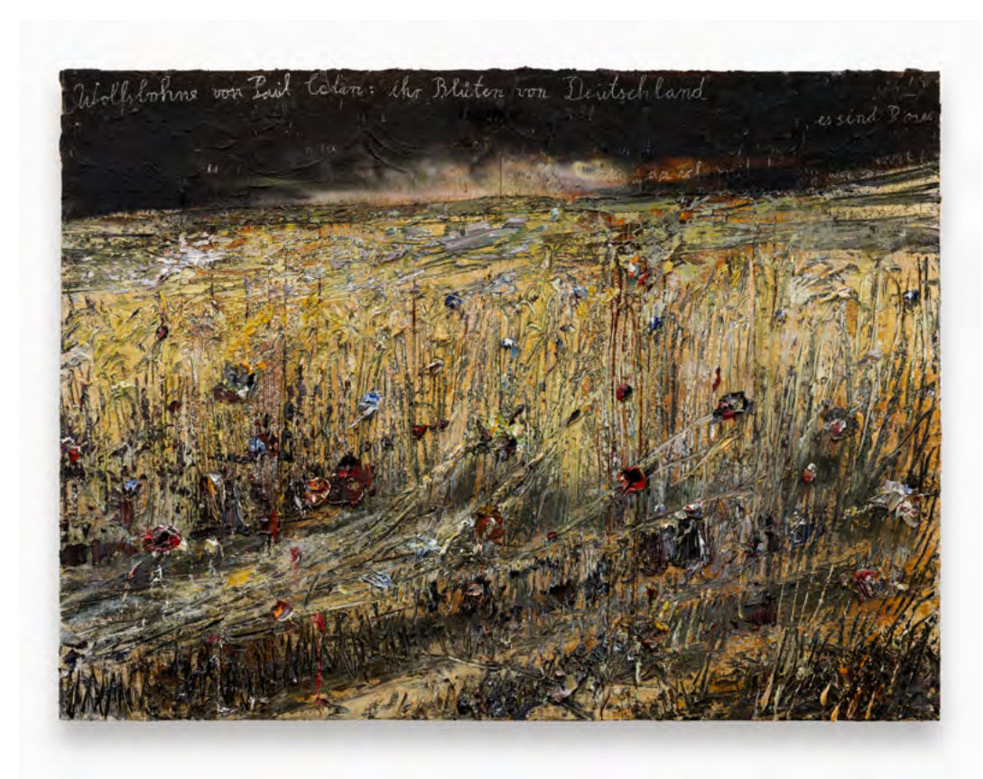
3. Anselm Kiefer, Wolfsbohne von Paul Celan: ihr Blüten von Deutschland, 2020

Anselm Kiefer's process is alchemical, allowing words, images and materials to merge and mutate on the canvas. In works like Oh Halme der Nacht (2020) and Für Paul Celan - Angewintertes (2014–2020), he incorporates substances that directly refer to the subject matter of the paintings: straw in the wheat fields and pieces of porcelain in the snow scenes. Several of the artist's new works feature a technique in which he applies shellac — a naturally occurring varnish — melting and burning it onto the painting to create an opalescent effect. Next to smokelike forms or apparitions, the material adds an unprecedented, almost spiritual dimension to Anselm Kiefer's already metaphysical paintings.