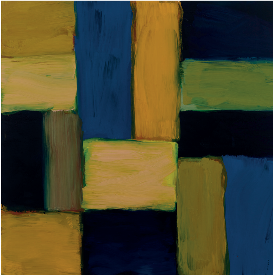
Sean Scully, Star , 2021. Oil on linen. 160 x 160 cm (63 x 63 in).

Two examples of Inset works are also on view, Black Window Pale Land (2020) and Wall Landline Dark Yellow (2021). Both composed of rectangular cut-outs, the paintings demonstrate Sean Scully's continuous architectural and sculptural approach. Black Window Pale Land features horizontal stripes with a window-like, black square inset, while Wall Landline Dark Yellow embeds a colourful Wall of Light painting. The use of a solid black square, recalling the Russian avant-garde artist Kazimir Malevich (1879–1935), is a new form in Sean Scully's practice. It has emerged in response to the effects of the pandemic, as Sean Scully stated in April 2020 in The New York Times : 'We have what we idealistically imagine, which is represented by this seductive painting, and what we actually have, which is a blacked-out view, a very uncertain view.'