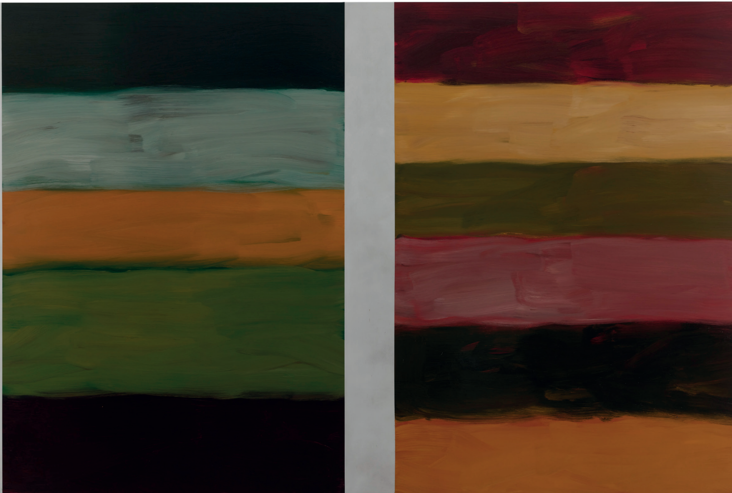
Sean Scully, Mirroring Green , 2020. Oil on aluminium. 250 x 400 cm (98,43 x 157,48 in). © Sean Scully.

Thaddaeus Ropac 7, rue Debelleye 75003 Paris