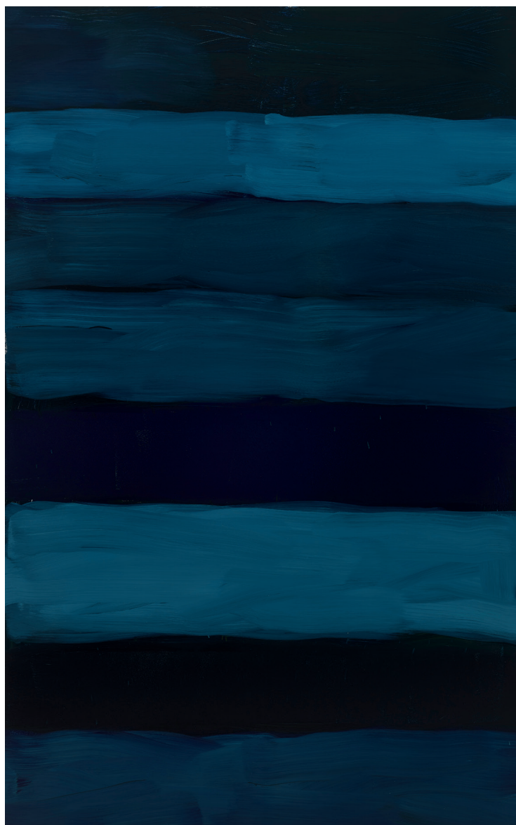
Sean Scully, Landline Rising Blue , 2018. Oil on aluminium. 300 x 190 cm (118.11 x 74.8 in).

Although they are strongly abstract, Sean Scully's paintings are informed by life, experience and sensation: 'Nearly everything I have in my work is from memory. From my Irish gran and from work, working in a factory, working the baling machine, loading trucks, setting type, printing. So I took all this experience and learnt to make it into art.' The repetition in his work is not just formal, it also seems to translate the modern condition of work and its repetitive tasks. Yet the play on variations is emancipating as it celebrates infinite diversity and possibilities.