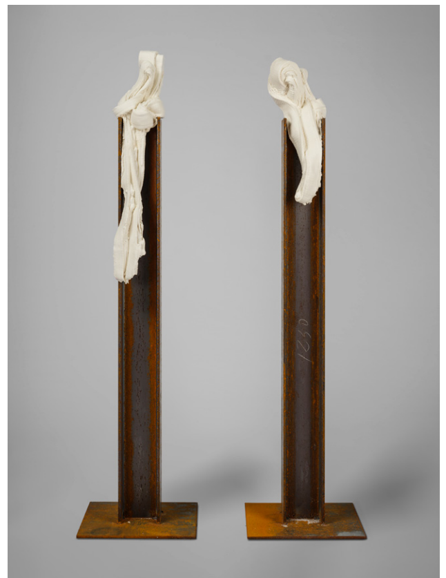
Yongju Kwon, Sling Belt 1"-3M, 2"-4M , 2022. H-beam, sling belt and jesmonite. Each 145 x 35 x 35 cm (57.09 x 13.78 x 13.78 in).

Reflecting his sustained investigation into labour and artmaking, Yongju Kwon (b. 1977) repurposes