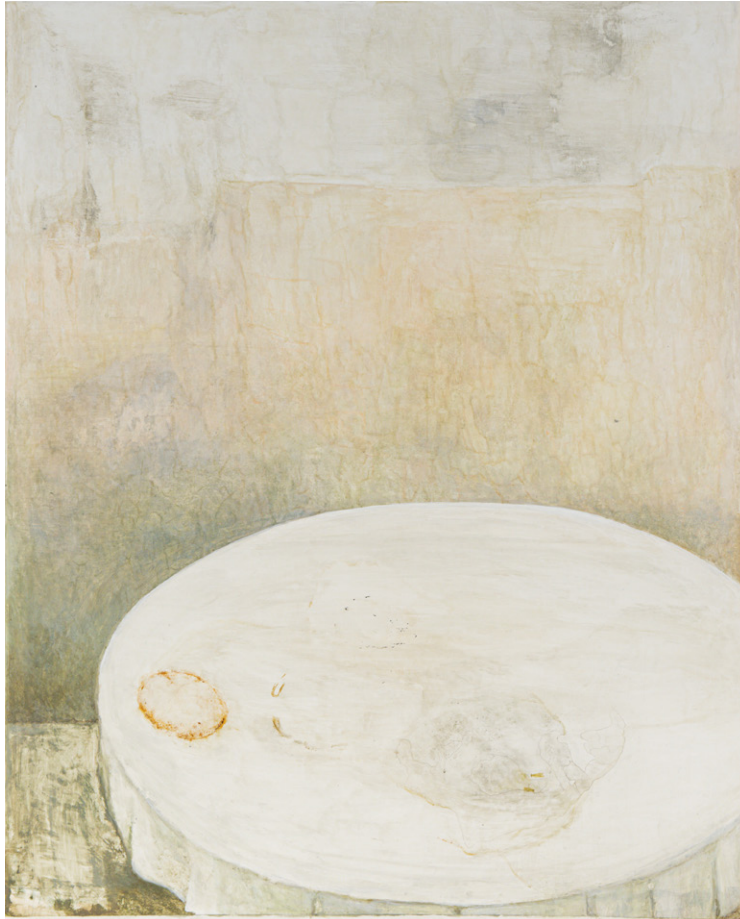
Lee Hai Min Sun, Still Life _ sediment , 2023. Acrylic on photographic paper. 115.3 x 93.3 cm (45.39 x 36.73 in).

Thaddaeus Ropac Seoul Fort Hill 1-2F, 122-1, Dokseodang-ro, Yongsan-gu, Seoul