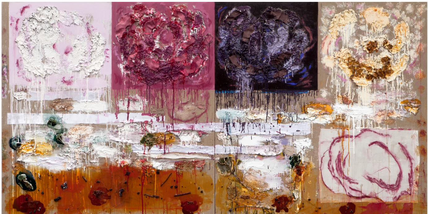
Symphony VII , 2014, oil, acrylic, papier-mâché, pastel, silk, berries, and dried sunflowers on linen, in two parts, 54 by 18.25 inches