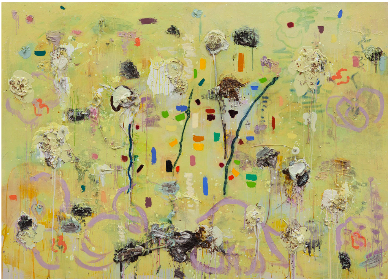
Lady , 2015, oil, acrylic, and dried flowers on canvas, 54 by 76 inches

I HAD THE GOOD fortune to visit with painter Joan Snyder in her Brooklyn studio in January. She greeted me in paint-splattered clothes as we made our introductions and continued into her living room, where some of her historic paintings, prints, and drawings sparkled. We then proceeded out the back door and through the backyard, past a small fishpond, and into her studio. A renovated carriage house held ample work space and various tables ordered with jars, bottles, tubes, cans, brushes, and other tools for art-making. Several skylights diffused cool light over a series of freshly painted canvases. The new pieces conveyed her signature iconography: luscious fields of color, heavy impasto contrasted by areas of bare canvas, gestural brushstrokes bleeding drips of paint, and embedded mixed media. Various combinations of glitter, silk, dried flowers, earth, burlap, and more were layered beneath a medley of acrylic paints, gel mediums, oil paint, and oil sticks, and spoke in chorus along the studio walls.