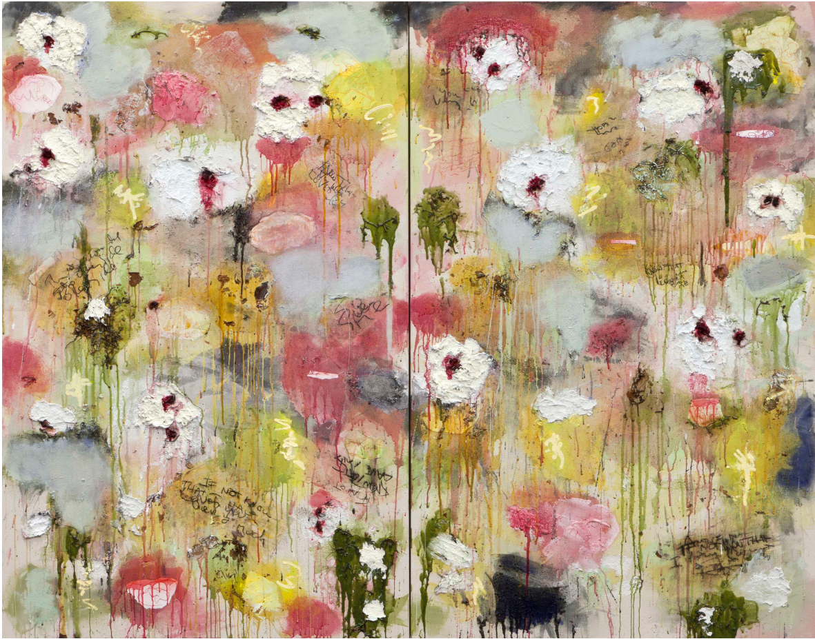
Amor Matris , 2015, oil, acrylic, papier-mâché, paper, etching fragments, rosebuds, twigs, and glitter on canvas, 66 by 84.5 inches