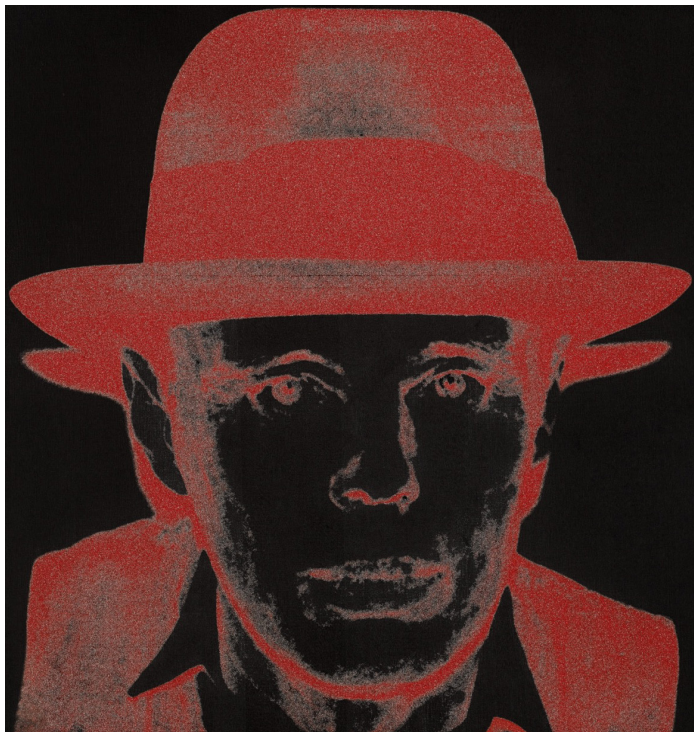
Andy Warhol, Joseph Beuys (Diamond Dust) , 1980 Silkscreen ink and diamond dust on canvas. 101.6 x 101.6 cm (40 x 40 in) © The Andy Warhol Foundation for the Visual Arts, Inc. / DACS, London, 2023

In his portraits, Warhol transformed his photographic source material through a process of reduction that resulted in emblematic, icon-like representations of his subjects, minimising the visibility of his own hand as he employed screenprinting methods. 'With silkscreening,' he explained, 'you pick a photograph, blow it up, transfer it in glue onto silk, and then roll ink across it so the ink goes through the silk but not the glue. That way you get the same image, slightly different each time.' Warhol pursued variation in his