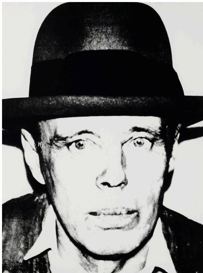
Andy Warhol, Joseph Beuys, 1980 (detail) Silkscreen ink on paper. 100 x 79 cm (39.37 x 31.1 in).