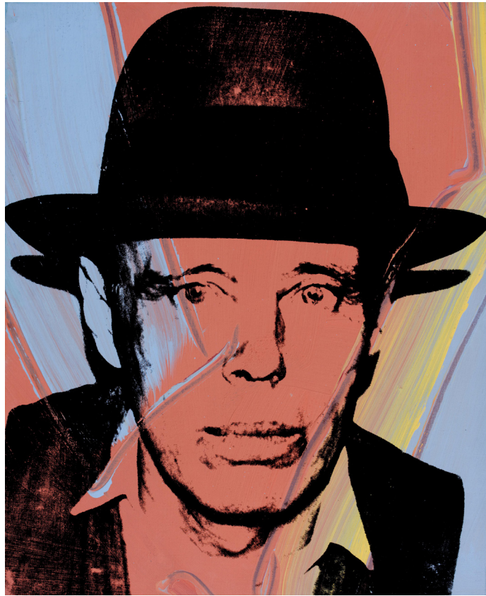
Andy Warhol, Joseph Beuys , 1980 Acrylic and silkscreen on canvas. 50.8 x 40.6 cm (20 x 16 in)

Thaddaeus Ropac Ely House, London 37 Dover Street, London, W1S 4NJ