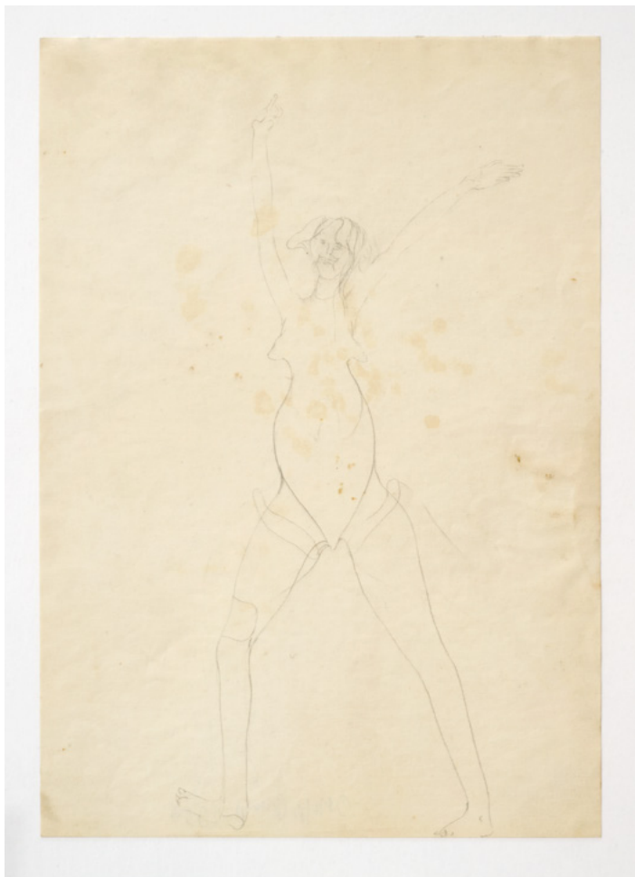
Joseph Beuys, Untitled (Girl) , 1956. Pencil on paper. 29.7 x 21 cm (11.69 x 8.27 in). © Joseph Beuys Estate / VG Bild-Kunst, Bonn, 2023

In the 1950s, Beuys continued his investigation into spiritual forms of post-war reconstruction through the theme of the female nude. Archetypal female figures, articulated using sparse lines of pencil and thin washes of watercolour, spring across sheets of paper, functioning as bridges between spiritual and earthly realms. Depersonalised and with their bodies routinely cropped by the dynamic compositions of the works, these figures are often depicted either holding children or next to amphora-like vessels that echo the shape of their exaggerated hips, characterising the women as symbols of fertility and regeneration.