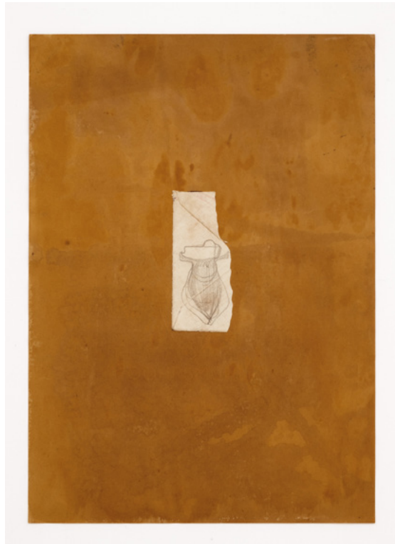
Joseph Beuys, Untitled (Honey Pot) , 1949. Pencil on torn envelope, mounted on paper coated with ferrous watercolour or Beize. Sheet: 29.5 x 21 cm (11.61 x 8.27 in) © Joseph Beuys Estate / VG Bild-Kunst, Bonn, 2023

Thaddaeus Ropac London Ely House 37 Dover Street, London, W1S 4NJ