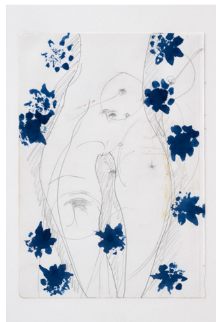
Joseph Beuys, Untitled , undated. Pencil and opaque watercolour, yellow abrasion. Paper: 23 x 16.5 cm (9.06 x 6.5 in). © Joseph Beuys Estate / VG Bild-Kunst, Bonn, 2023

Joseph Beuys: 40 Years of Drawing explores the evolving role of drawing across the artist's long period of artistic creation, beginning in the mid-1940s when he enrolled at the prestigious Staatliche Kunstakademie in Düsseldorf and concluding with works made just before his death in 1986. Drawings and plant collages from the 1940s illustrate the artist's early interest in the deep interrelationships between humans, animals and the natural environment. Animals – including stags, elks, seals and bees – appear as highly coded symbols related to Christianity, Celtic folklore, German Romanticism and the natural sciences, and have been understood as spiritual antidotes to Beuys's experience of the personal and national traumas of the Second World War.