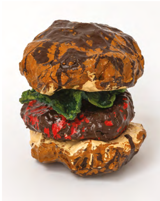
3. Sturtevant, Oldenburg store object, Hamburger and Lettuce on Plate , 1967

Sturtevant's approach resonates with the theories put forward by French philosopher Gilles Deleuze in his early masterwork Difference and Repetition (1968). In repeating the works of other artists through her own actions and movements, she creates difference , in the Deleuzian sense; that is, the distance that simultaneously separates and connects two entities. The exhibition's title, Dialectic of Distance , invites viewers to approach Sturtevant's works on these terms, as it repeats, fifty-five years to the day after its opening, Sturtevant's own re-creation of Oldenburg's Store .