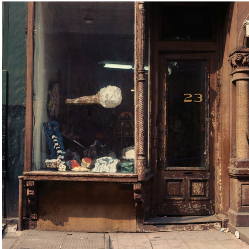
1. Sturtevant, The Store of Claes Oldenburg , 1967

Thaddaeus Ropac Paris Marais 7, rue Debelleye, 75003 Paris