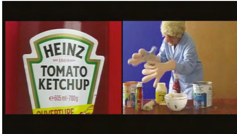
4. Sturtevant, Dark Threat of Absence , 2002

Also on view at Thaddaeus Ropac Paris Marais will be Sturtevant's re-interpretation of Paul McCarthy's 1995 performance Painter , titled The Dark Threat of Absence (2002). In Painter , McCarthy disguised himself as a cartoon-like character with exaggerated rubber prosthetics and wandered around a wooden set designed to look like an artist's studio. He was dressed in a blue garment, halfway between a painter's smock and a hospital gown, and periodically shouted 'de Kooning!' in a clear parody of the Abstract Expressionist painter. As a re-enactment of an artist acting as another artist, The Dark Threat of Absence represents a unique mise en abyme of Sturtevant's practice.